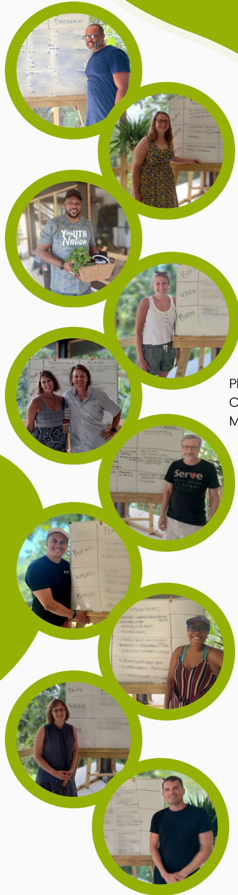
PHOTOS: CLOSING RENEWAL MAP WORK

94 Men & Women Journeyed through our Pain & Possibilities Retreats in 2023