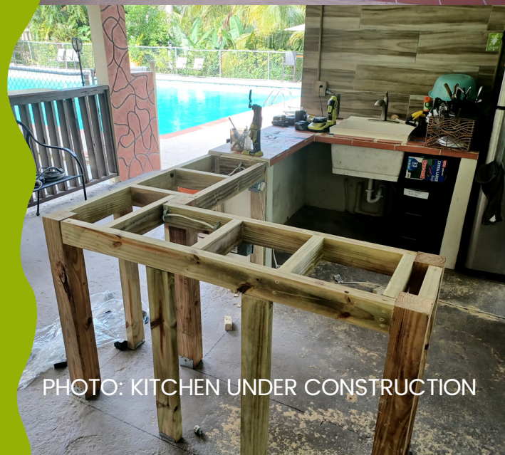
PHOTO: KITCHEN UNDER CONSTRUCTION