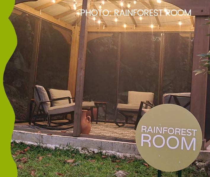
PHOTO: RAINFOREST ROOM

One day we noticed the pool losing water. We had a massive crack! Out of necessity we had to completely renovate the pool - empty it, repair the old cracks, re-tile and replaster it. We even added some LCD lights while we were down there. Now it's like brand new!