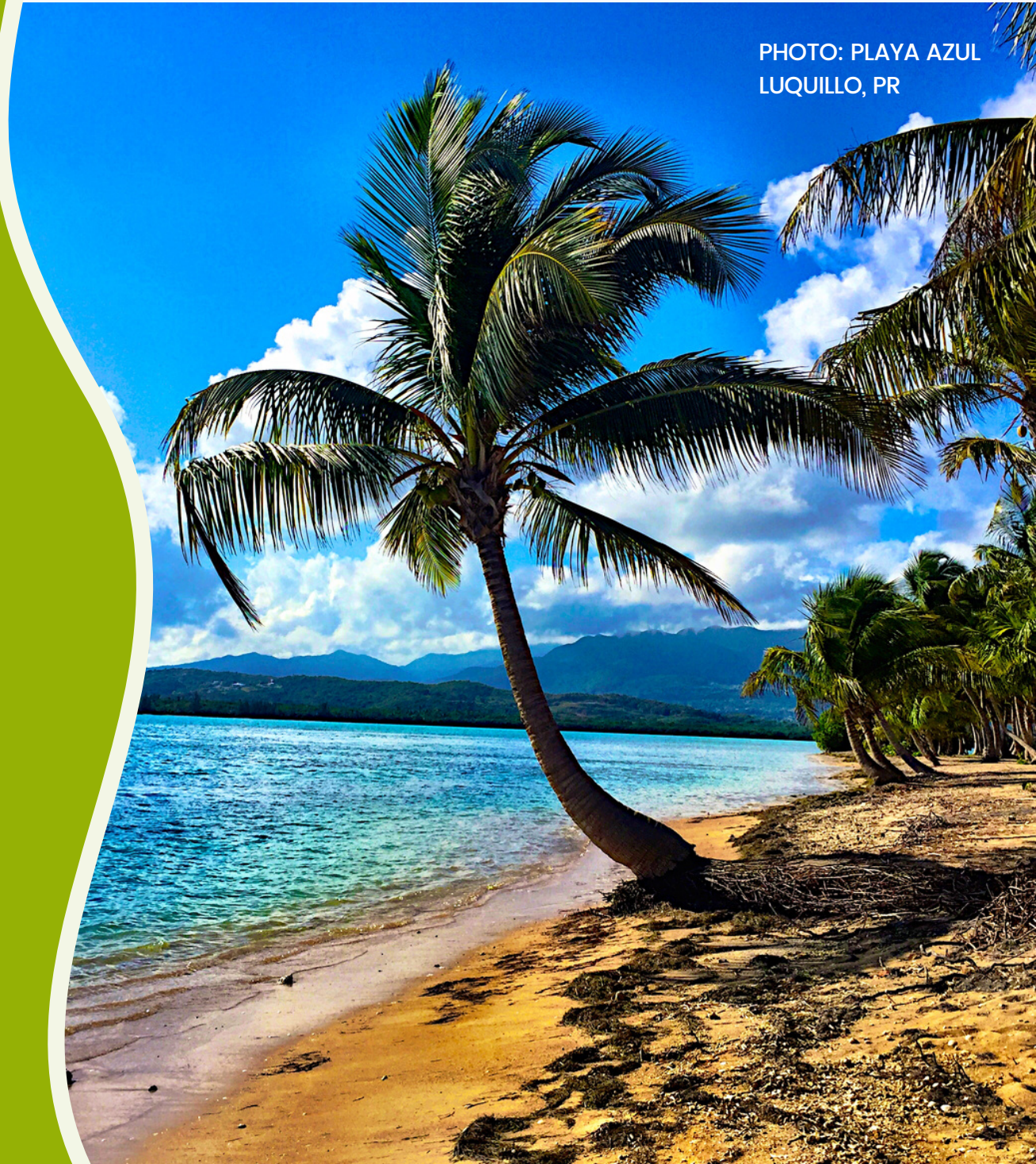
PHOTO: PLAYA AZUL LUQUILLO, PR